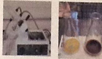
Figure 3. Alcoholic distillation and titration.

Method 1 (ferrous ammonium sulfate titration) Method 2 (sodium thiosulfate titration) Method 3 (refractometer)